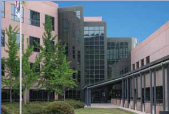
SurModics Pharmaceuticals Manufacturing Facility